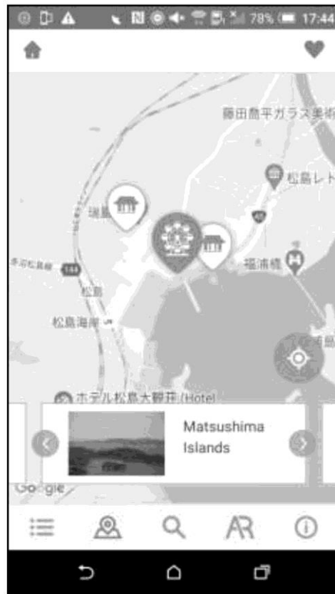
Fig 1: Non-linguistic Evacuation-route Navigation System

An algorithm based on a slime mold algorithm developed by the authors can be applied as the search method for evacuation routes. The authors have furthermore developed a method for conducting more precise searches by adding the disaster risk level as a new indicator. (Yoshitsugu et al., 2019; Yoshitsugu et al., 2020).