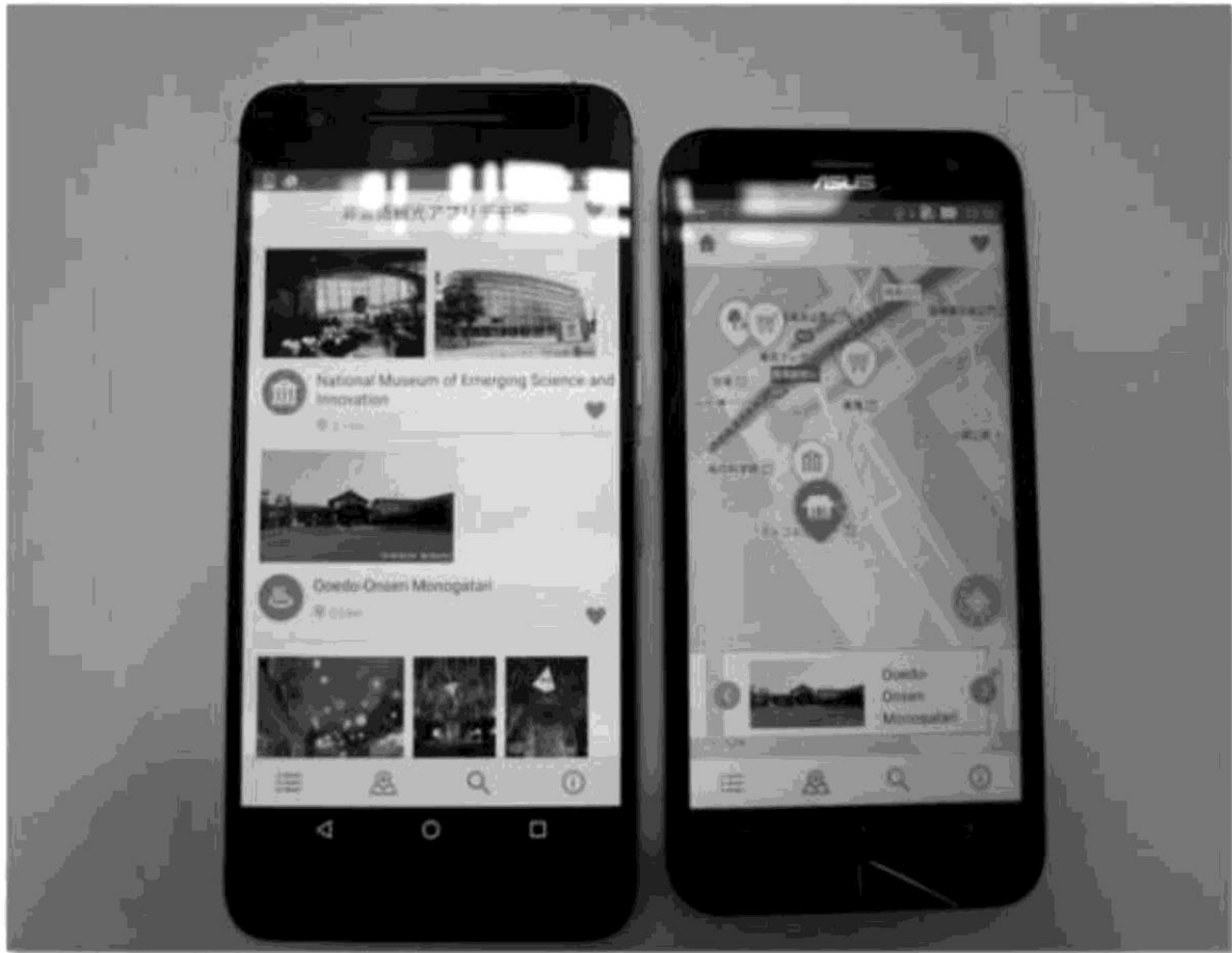
Fig 3: Prototypes